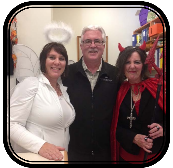
Student Affairs employees, Bookstore staff and some students and instructor from the WEST Program dressed for the occasion.