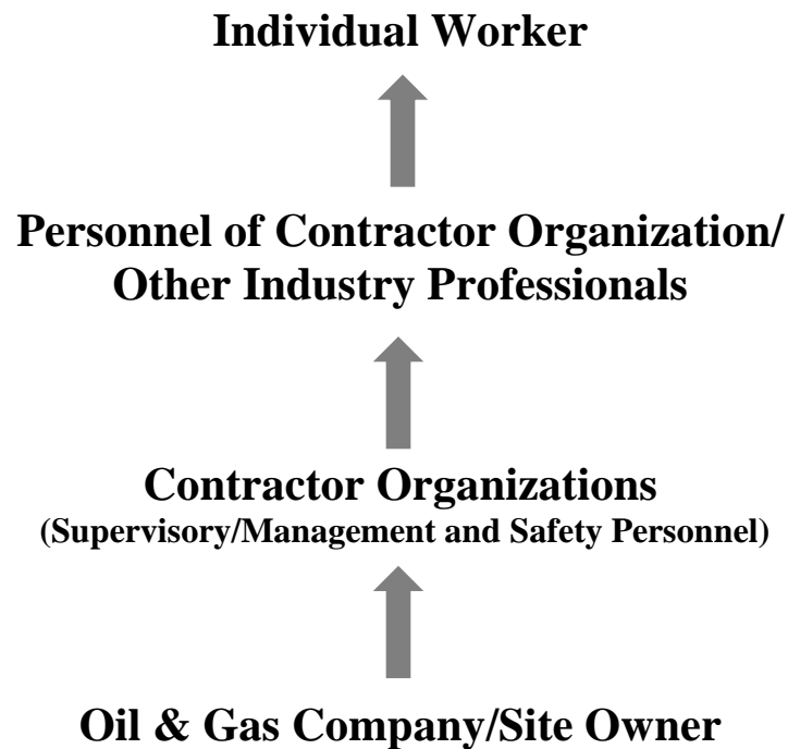
Figure 2. Model of workplace support focused on human safety.

With oil and gas companies/site owners as the foundation for this model, these organizations must first understand the implications that an overemphasis of safety performance metrics has on reporting practices. From this understanding, oil and gas companies/site owners and contractor organizations can work together to create stronger safety cultures that value human safety over safety performance metrics. Moreover, with the oil and gas companies/site owners understanding their fundamental role in the development of a strong site safety culture, oil and gas companies/site owners and contractor organizations can work together to support enacted safety values that are in alignment with espoused safety values. With personnel of contractor organizations observing alignment between espoused safety values and enacted safety values from both the oil and gas company/site owner and contractor organization, it is anticipated that stories and observations of undue layoffs and job terminations caused by