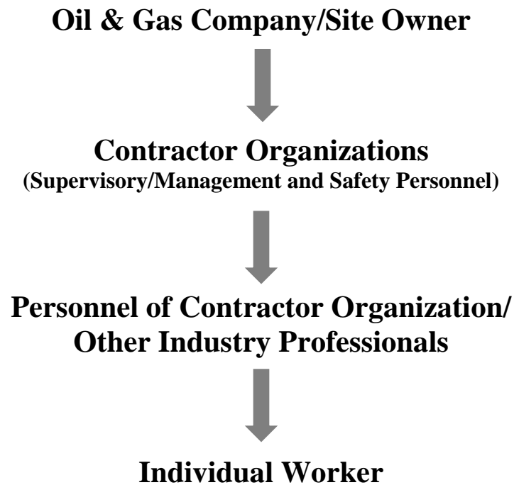
Figure 1. Workplace pressure application on the individual worker.

In summary, this workplace pressures model can be likened to a chain reaction. The oil and gas company/site owner sets their safety expectations and make it known to the contractor organizations that the continuation of a project contract is tied to good contract safety performance; the supervisory/management and safety personnel of the contractor organization then set their safety expectations and make it known to their personnel that the continuation of the project contract, and therefore job stability, is tied to good contract safety performance. As a result, workers and other industry professionals experiencing these pressures on site share their insights on reporting with other personnel. When this model is enacted, centralization (control) is valued over decentralization (autonomy) and teamwork (cooperation), and we can begin to understand the pressures felt by the individual worker when deciding to report or not report and incident. Moreover, the oil and gas company/site owner, contractor organizations